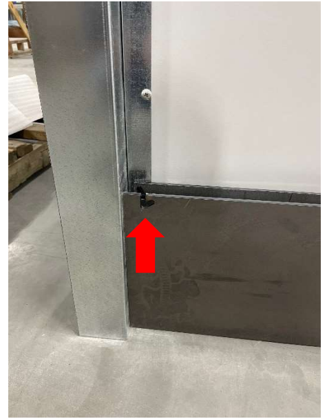
Inside notch = outer weight

Sashes can be placed in their proper track at the front of the hood. Window boards should be used to prop up the sashes to easily connect them to their counterweights.