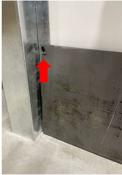
Outside notch = inner weight

Note – some counterweights will have a “bow” or camber to them from the cutting process. It is important that the bow in both counterweights face the same direction to avoid them interfering with one another during operation.